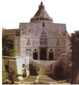
Church of the Annunciation

We spend the morning in Nazareth, where Jesus played, grew up amongst the other children of the city, and later worked with Joseph in carpentry. It is here in the Church of the Annunciation just behind the altar where you can see the grotto where Mary said "yes" to the angel of the Lord. We will celebrate Mass (subject to confirmation) at the church of the Annunciation. We visit St. Joseph's carpentry shop and Mary's well. Next, we stop in Cana, where Jesus performed his first miracle, changing the water into wine. Married couples will have the opportunity to renew their wedding vows to one another before we return to our hotel in Nazareth for dinner and overnight.