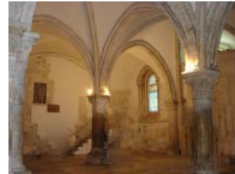
< Ein Karem ^ Upper Room