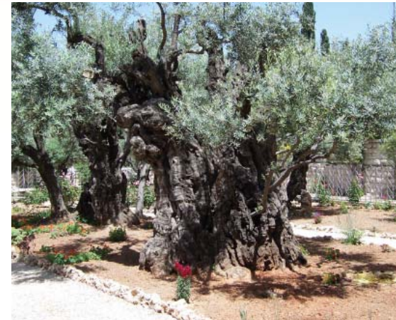
Garden of Gethsamane