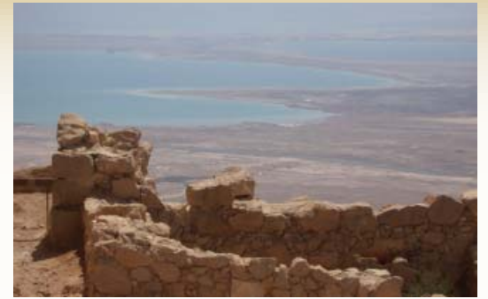
View of the Dead Sea from Masada

Early this morning, we prayerfully follow the Via Dolorosa (Stations of the Cross) through the old city to the Church of the Holy Sepulchre, where we pray on top the Rock of Calvary, inside the Lord's tomb and celebrate Holy Mass (subject to confirmation). After Mass, we return to our hotel for breakfast. Then, we drive to the Mount of Olives for a panoramic view of Jerusalem. We visit the Church of Pater Noster and the Chapel of Ascension and then we walk down the hill to Dominus Flevit Chapel, where Jesus wept over Jerusalem. We proceed to the Garden of Gethsemane and the Church of All Nations where Jesus endured his Agony. This afternoon, we visit Pilate's Judgment Hall, the Chapel of Flagellation, Lithostrotos, and the Arch of Ecce Homo ("Behold the Man") and the Convent of the Sisters of Zion. Dinner and overnight.